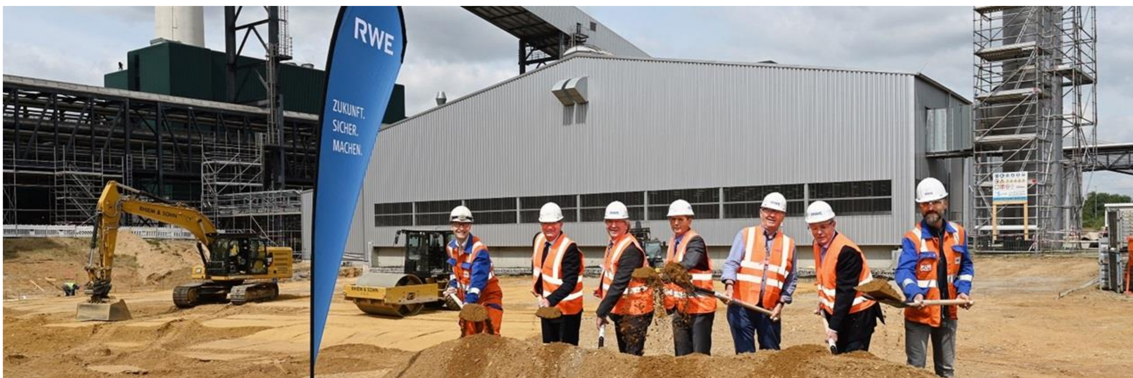
Continuous expansion of infrastructure: Ground-breaking ceremony for the expansion of the sewage sludge hall at Knapsacker Hügel (2019)

Almost two million tonnes of sewage sludge are produced in NRW every year. Almost every second delivery is thermally utilised by RWE. But in the future, phosphorus, an element essential for life on earth, will also be extracted from sewage sludge.